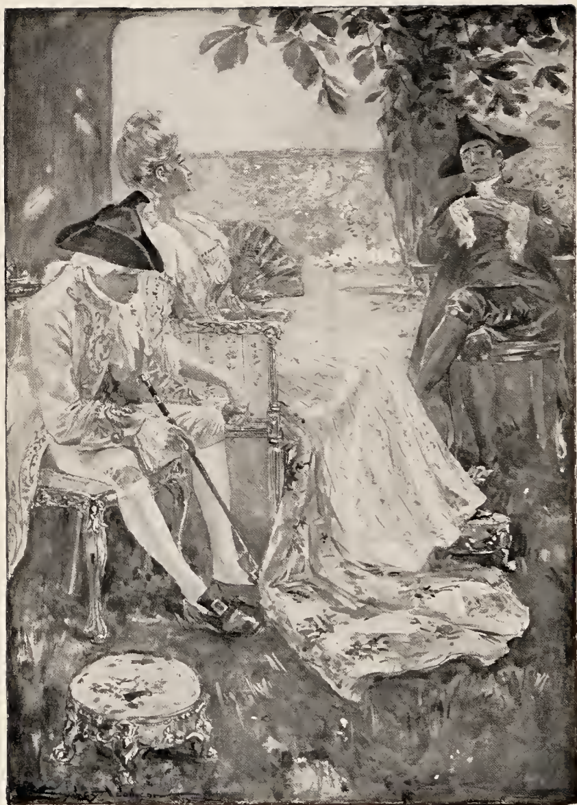
IN THE GARDEN AT TEMPLE BOW.